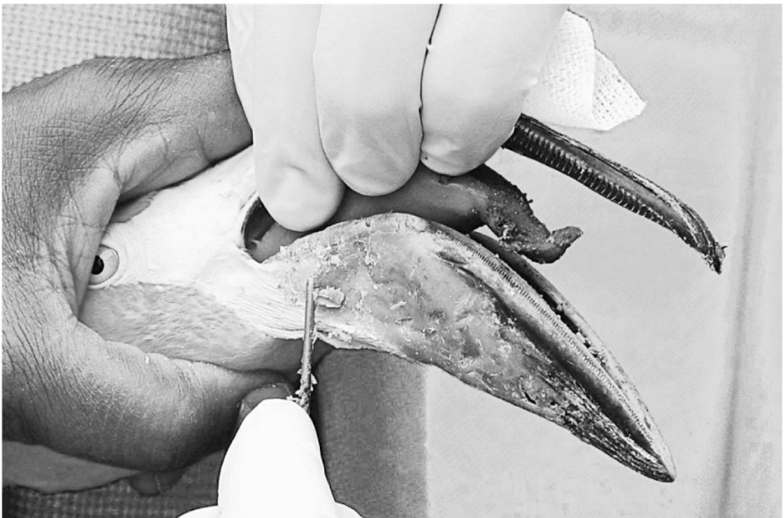
Figure 3. Deformation of the tongue due to a bill impaction with grease and mud in a Caribbean flamingo ( Phoenicopterus ruber ).