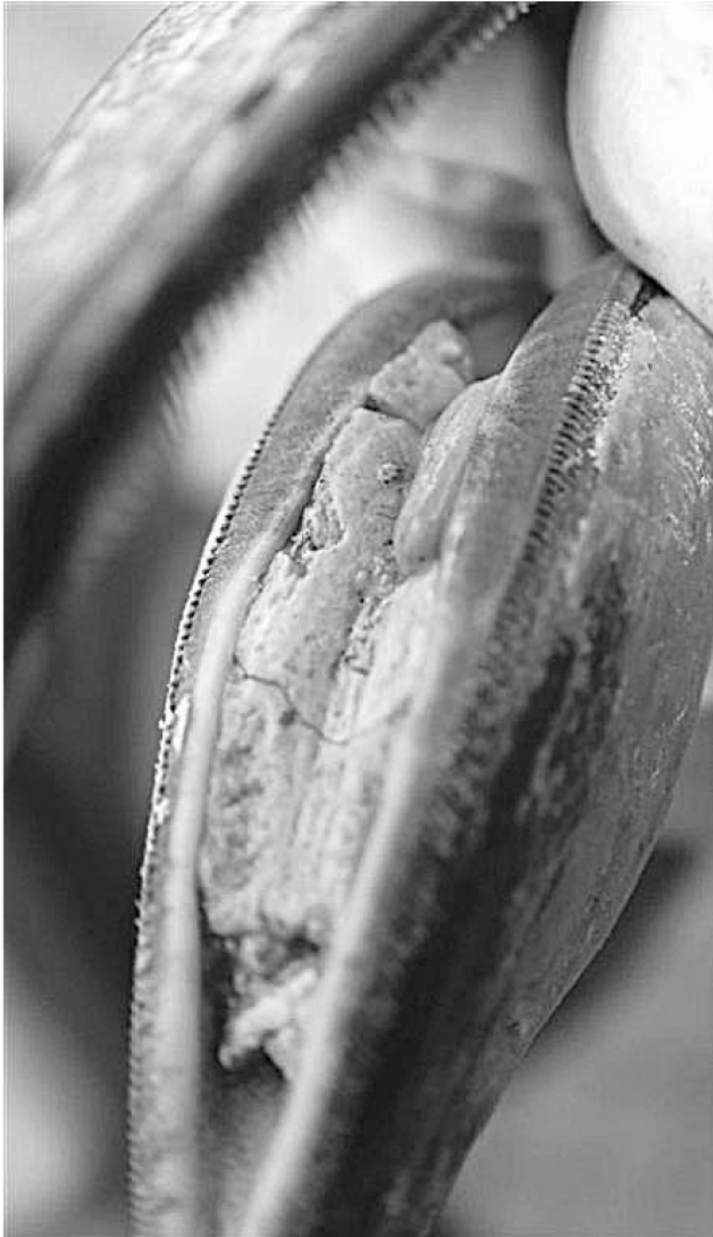
Figure 4. Bill impaction with a mixture of grease and mud in a Caribbean flamingo ( Phoenicopterus ruber ).

an irregularly folded tip (Fig. 3). The gular area bulged and was hard on palpation. A blood sample taken from the jugular vein revealed no abnormalities with respect to a complete blood count and a