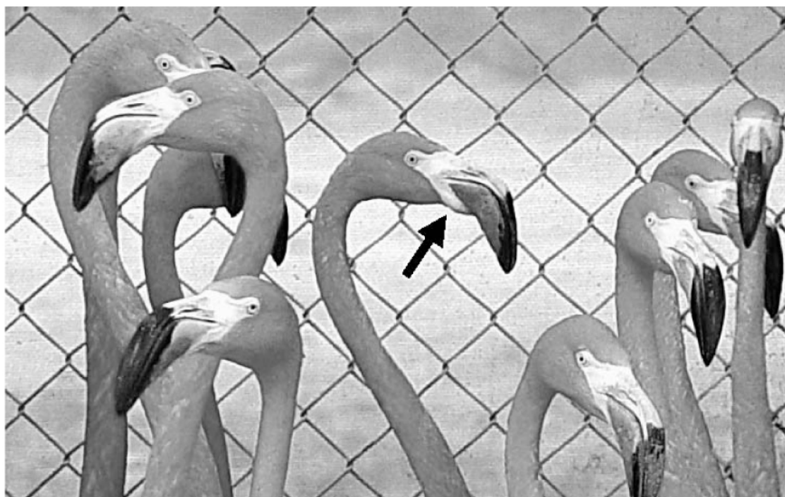
Figure 5. Group of Caribbean flamingos ( Phoenicopterus ruber ). Note the bulging of the gular area normally only observed during feeding (arrows) in some birds.

weakness. However, it was only after the clinical examination of this case and a literature search that the relevance of an abnormal extension of the gular area was understood. Our case, therefore, emphasizes the usefulness of anatomic knowledge of species with particular morphologic adaptations.